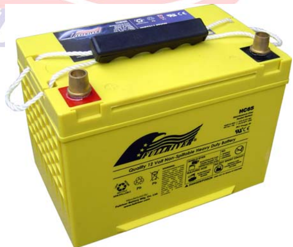
Battery Model: HC65/T Battery Terminal: T (M8 Button terminal fitted with TP28 brass automotive terminal)