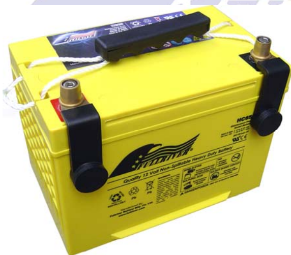
Battery Model: HC65/ST Battery Terminal: ST (M8 Button terminal fitted with TP28 brass automotive terminal and Side terminal)