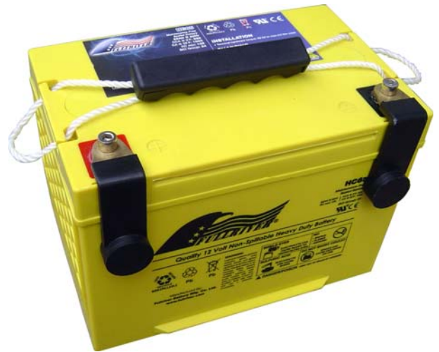
Battery Model: HC65/S Battery Terminal: S (M8 Button terminal Fitted with side terminal)