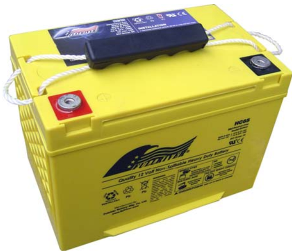
Battery Model: HC65 Battery Terminal: M8 (Button terminal)